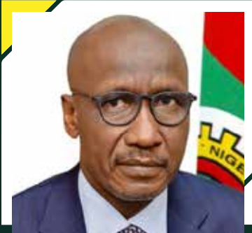
Mele Kolo Kyari

Group Managing Director, Nigerian National Petroleum Corporation (NNPC)